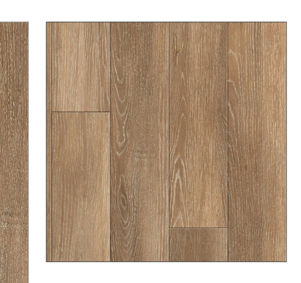
HOLLY OAK - Event Series 6" x 48" 36 sq. ft. per carton Tarkett