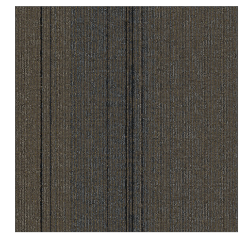
FRANKLIN - Side Stripe 24" x 24" 8 sq. yds. per carton Mohawk Group