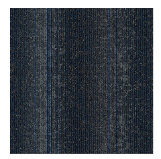
WEST POINT - Side Stripe 24" x 24" 8 sq. yds. per carton Mohawk Group