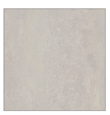
TEMPUS SOOTHE 18" x 18" 45 sq. ft. per carton Mannington