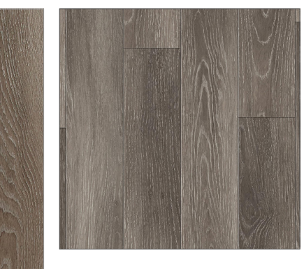
PROVENCE - Event Series 6" x 48" 36 sq. ft. per carton Tarkett