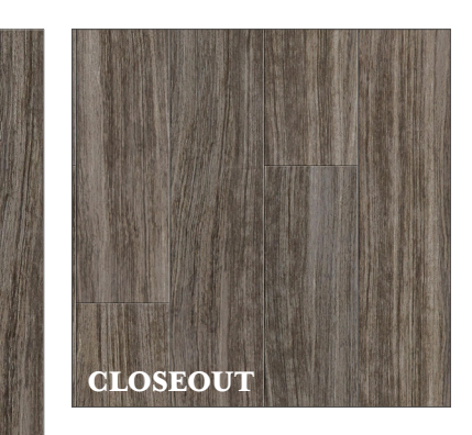
BRUNSWICK - Event Series 6" x 48" 36 sq. ft. per carton Tarkett