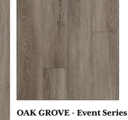
6" x 48" 36 sq. ft. per carton Tarkett