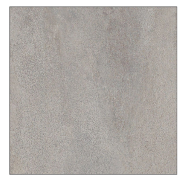
TEMPUS EMBRACE 18" x 18" 45 sq. ft. per carton Mannington